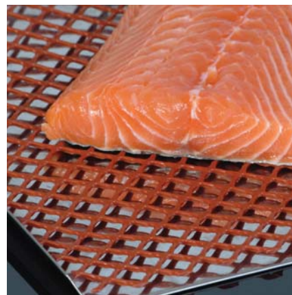
Our Premium Smokehouse Netting has a flatter, smoother surface than our original product. The new design reduces sticking and is perfect for smoking delicate seafood products.