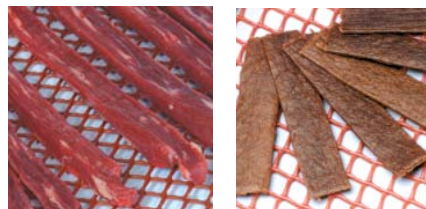
Our original Smokehouse Netting is frequently used for lining trays to smoke beef jerky. The open mesh allows for even air circulation and the diamond pattern enhances the grilled appearance on meats.