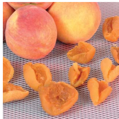
Natural net is ideal for drying fruits, vegetables and flowers. It will not discolor the delicate vegetation.